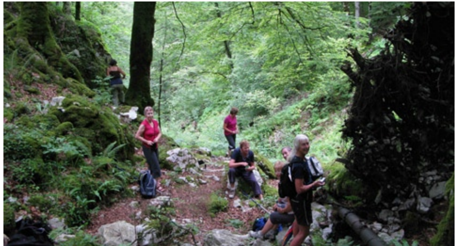
A well earned break while exploring a gorge deep inside the Basque country

In Sarlat the fascinating blends of past and present. Behind the newly made dark steel industrial doors, a 15 century church is transformed into a covered market. Inscribed inside: “Architecture is a blend of nostalgia and extreme anticipation”.